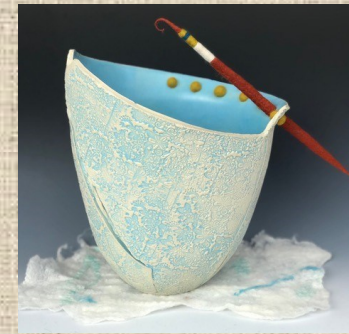
2nd Place: Variations in Vessels II - by Cindy Wedig