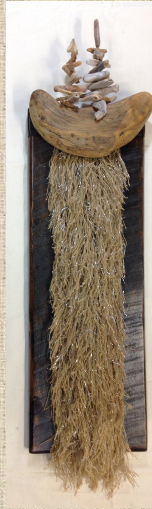
1st Place: Silver Island - by Stella Larkin